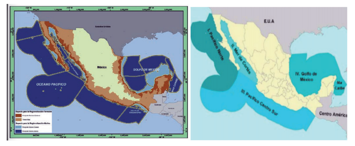
Figure 1. To the left coastal marine regions of Mexico according to Espejel and Bermudez (2009) and to the right the five Mexican seas which are used officially for marine ecological ordinances (source Rivera-Arriaga and Villalobos, 2001).